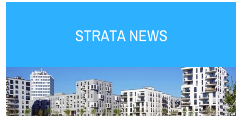
Asbestos Industry Update - NSW

How often does your common property need to be inspected?