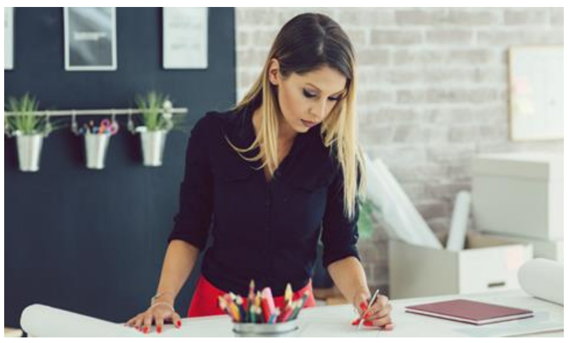
A Recent Asbestos Case

Think property styling is only for sales? Think again. Styling is fast becoming a popular option with rental properties as a tool to increase rental returns.